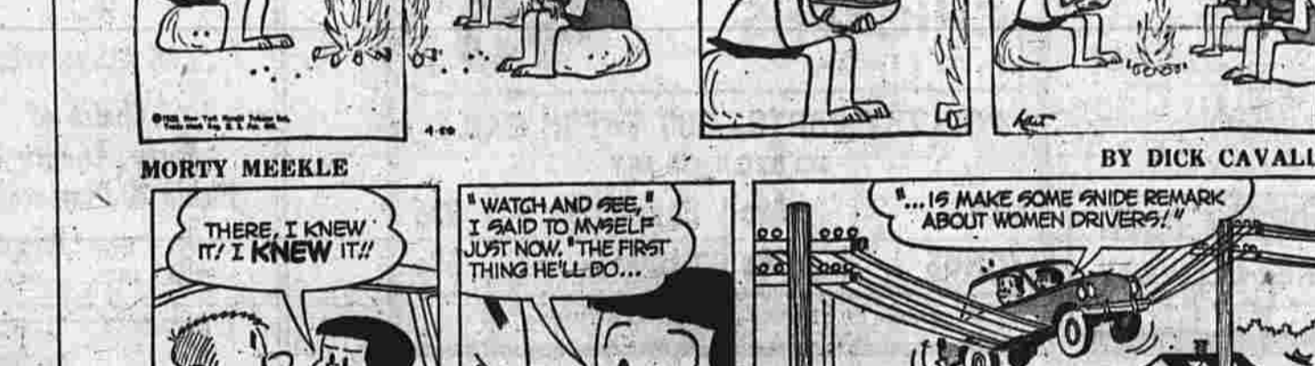
MORTY MEBELLE BY DICK CAVALLI