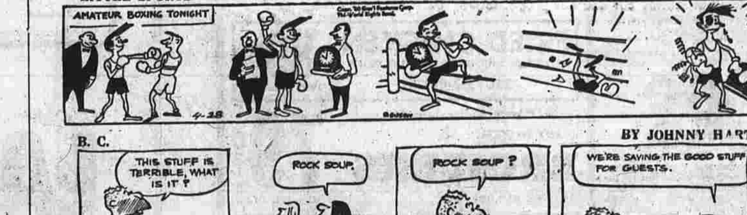
B. C. BY JOHNNY HART